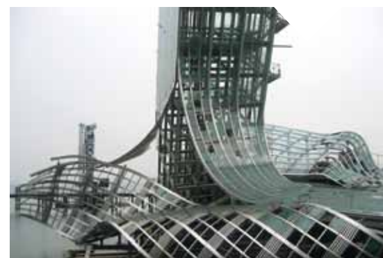
Floating stage, Bregenz Festival