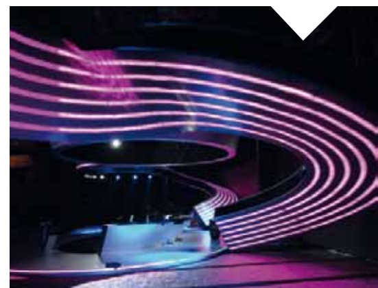
Stage elements for international sporting events.

As you can see, the future has only just begun.