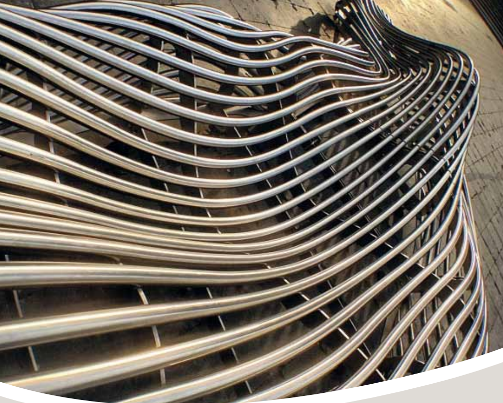
Challenging forms – Model C part of the project „Benchmark“